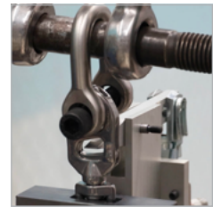
Individual proof-load testing